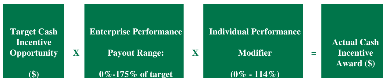
ILLUSTRATION OF 2017 AIP DESIGN

Actual Cash Incentive Awards. The following table shows actual performance as a percent of target based on the 2017 results for each component of the AIP, and the actual cash incentive award for each NEO. The following discussion explains how the payouts for each component were determined.